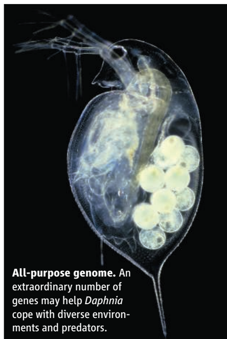
All-purpose genome. An extraordinary number of genes may help Daphnia cope with diverse environments and predators.

Part of the appeal for sequencing the genome of Daphnia is its ability to adapt—it